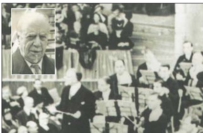
Sir Thomas Beecham, insert, conducting at the gala concert