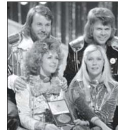
Left: Abba after winning the 1974 Eurovision Song Contest with Waterloo.

But most people in Brighton and Hove have affection for a building about to celebrate its bicentenary and consider it money well spent.