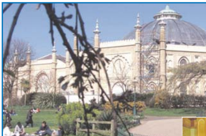
The Dome in 2002, after refurbishment and right, the entrance hall.

Seventy years ago the Dome concert hall in Brighton was transformed from a Victorian Moorish building into an art deco masterpiece.