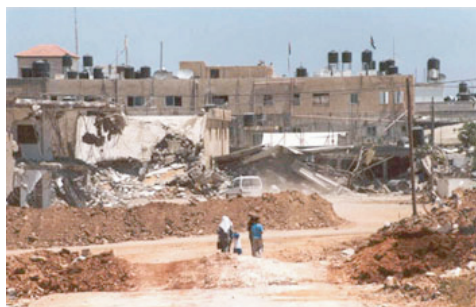
Palestinians walk home through bulldozed wreckage in Gaza

•What roles does civil society play in situations of violent conflict?