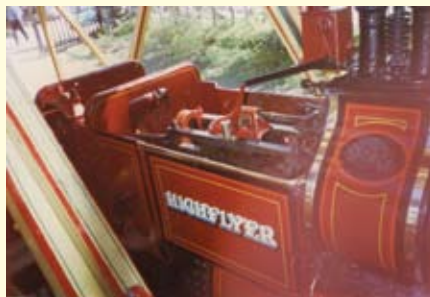
Highflier, an early project