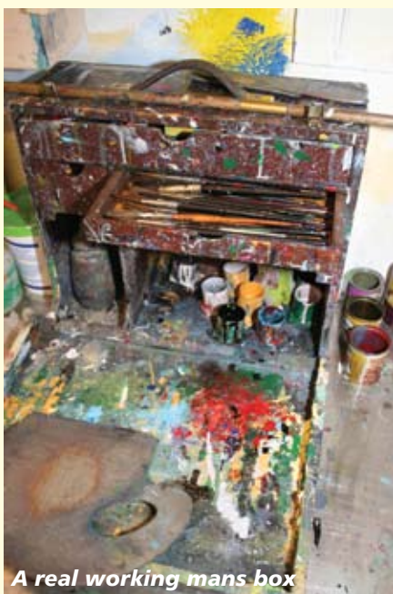
A real working mans box

How the young man that he was found the time and the energy we don't know, but on top of everything else he was doing he started offering his time as a volunteer at the Steam Museum in Hollycombe, Liphook, Hants. It was here at the home of a working steam-engine collection that he became an unpaid coachliner and sign-painter - in fact he did so much