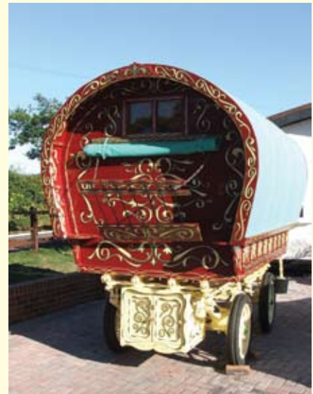
The customer watched every brush stroke

foot high, and the time that he got to paint a real Romany caravan, it took 70 hours with the owner watching just about every brushstroke. Then he had to restore the slate clock for Midhurst Parish Church... ..life is never boring for a man with a brush in his hand.