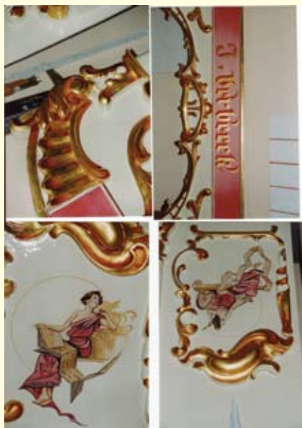
A sample of Wayne's beautiful traditional gilt work

"These days I am doing a lot of high-end traditional work, but I still find time for 'Beware of the dog' and 'Keep off the grass' type things, and the projects can vary from quite sophisticated work to a very naïve folk style." Explained Wayne, "And it can be useful living somewhere like Midhurst because in a very real way I follow the shops. You see I sometimes get to do the signage for what can only be described as vanity openings; you know the kind of thing. When somebody asks me to do the fascia for a shop specialising in dried frog-spawn scented soap or yaks cheese candles I sometimes wonder whether it's worth my while using undercoat because you can be sure that I'll be cleaning it off and starting again for the next incumbent before the paints properly dry.