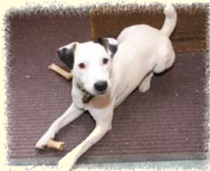
Sammy the Pup

A small and furious ball of energy that holds court in the place is Sammy the terrier who will come up and show you whatever toy he is worrying-at during your visit, to everyone's amusement.