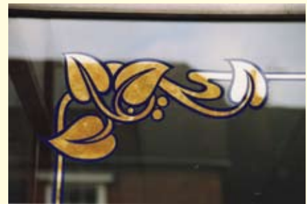
Controlled yet fluid

We asked him how he gets his customers, "Word of mouth," he answered, "plus the website and an ad' in Yellow Pages. I get a lot of business while I am working too, it must be the mahlstick and the brushes that get the attention. People literally say 'Do you do this for a living?' You can imagine what goes through my head in the way of an answer." And is he still enjoying the work? "I love it, I love the tight and controlled stuff as much as the free