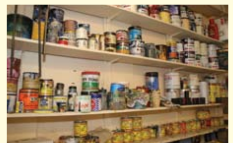
Keep the stock to hand