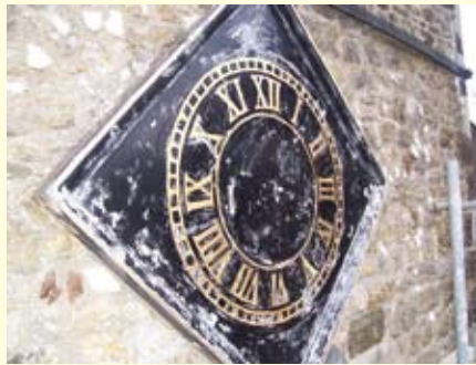
Before the Osbourne touch