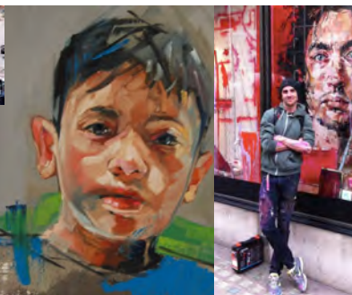
Nihad (5) by Andrew Sidalgo The first of the paintings to be sold.