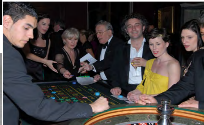
Playing the Casino Tables