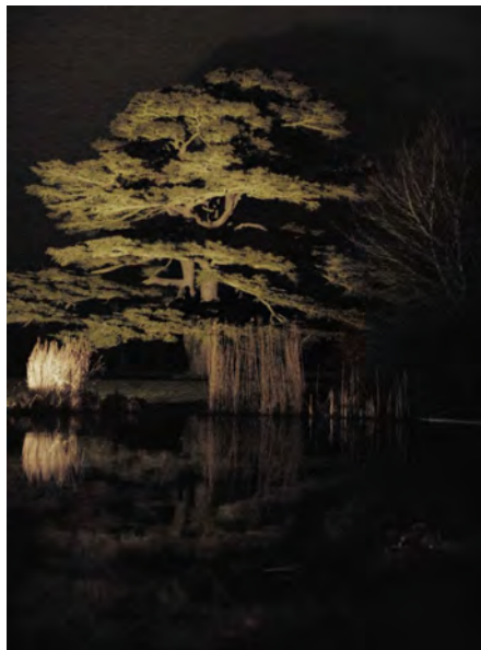
The amazing sight en route to The Long Hall