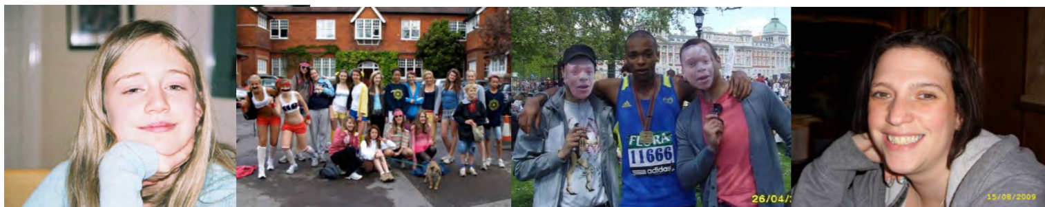
Pictured above from left to right

MARATHON EFFORTS: Our special thanks this year go to all those who have walked, run, skipped and jumped to raise funds for Miracles' work both here at home and in Bosnia. Sponsored events like these are a godsend to Miracles and we hope for many more in the future.