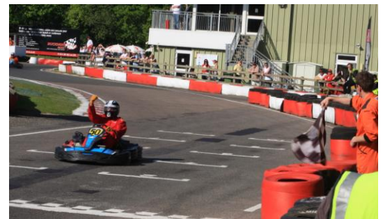
A jubilant and relieved 2010 winner Rifle Range Farm