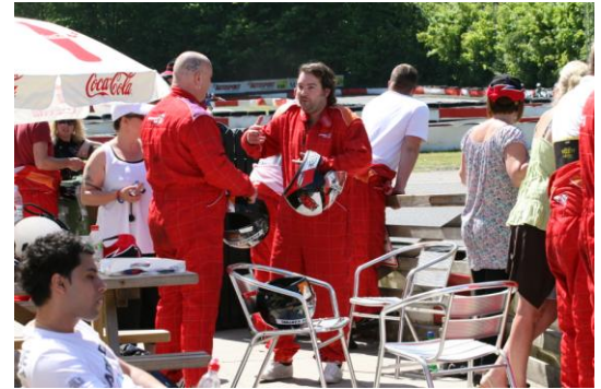
Team tactics or confessions of a spinning driver?