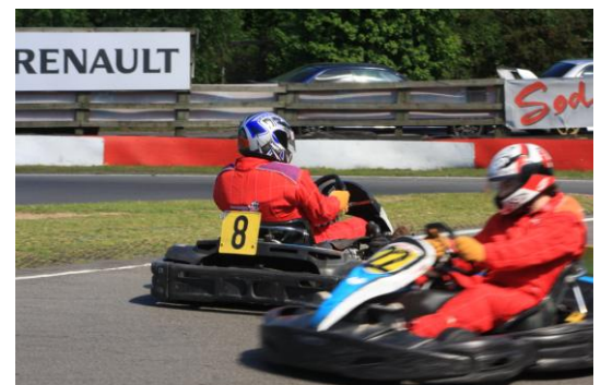
No 8 tries a new way of un-lapping himself