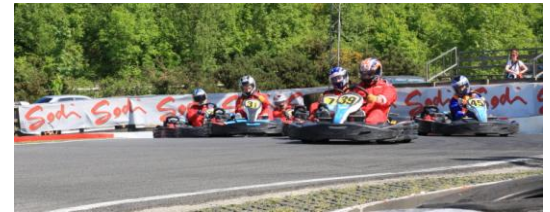
Six karts thru one corner, something has to give