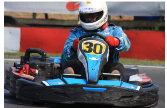
On the edge and round the bend (successfully)