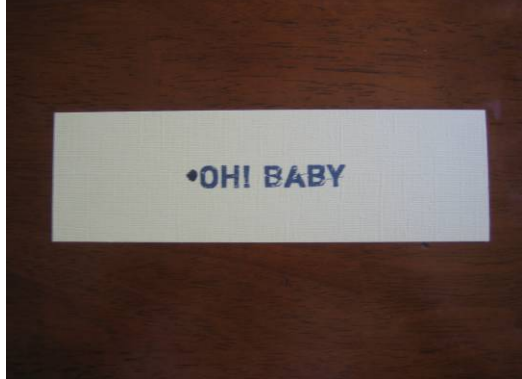
The print will begin on the paper as it appeared on the LCD.

The + located on the bottom right or left hand side of the Design Runner should be placed where the printing is desired (in this case where the black dot is marked).