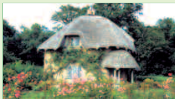
The Lodge, Stanbridge