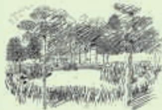
Artist impression of the new Governor's Garden

Admission: Adults £3.50, Children £1.80, Concessions £2.70.