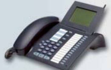
optiPoint 600 office The top-of-the-range model with illuminated touch screen display and electronic notebook for 320 personal numbers. Can be used either as a conventional digital phone or for data access to the IP network. Supports several web protocols.