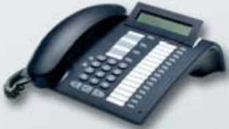
optiPoint 500 advance The telephone for professionals with: • illuminated display • 2 adapter ports • 19 function keys with LED • integrated interface for headset