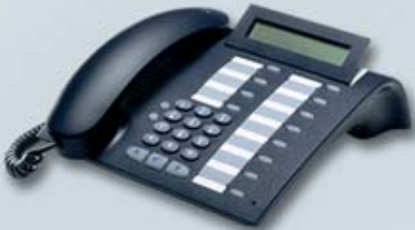
optiPoint 500 standard The system phone with display and full duplex handsfree function.