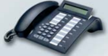
optiPoint 500 basic The system phone with integrated USB interface, display, loudspeaker and 1 adapter port.