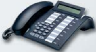
optiPoint 500 economy The cost effective digital entry model with display.