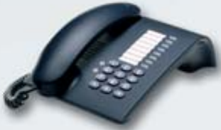
optiPoint 500 entry The cost effective digital entry model.

The following optiPoint 500 (two channel interface U_{PO/E} ) digital system phones are available to satisfy a wide variety of workstation demands: