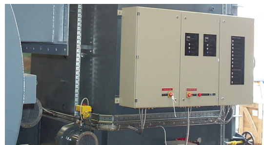
Concentrator chamber and control system