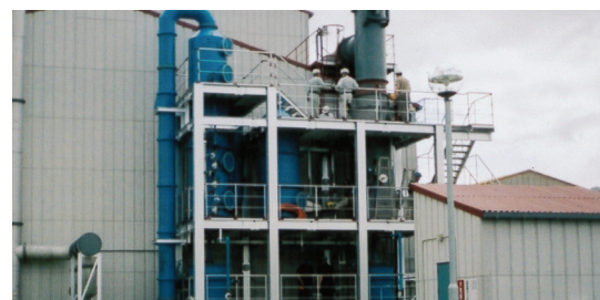
Flue gas treatment