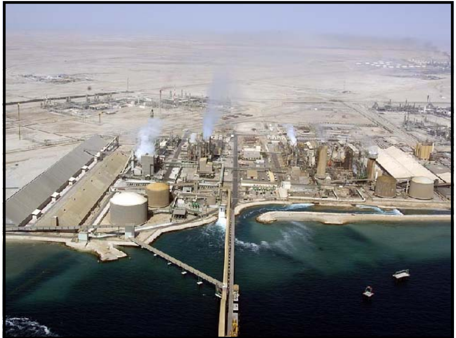
The QAFCO fertiliser production site in Qatar

ERG's subsidiary APC Process Engineering has already supplied similar packages to the QAFCO 1, 2, 3 and 4 lines over the last 30 years, so winning this contract has continued the success story.