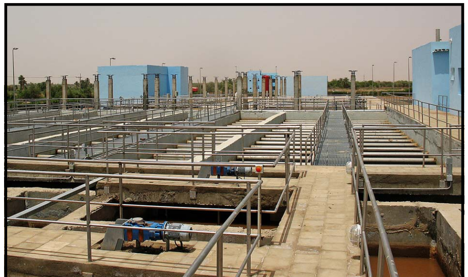
Construction work on the Omdurman water treatment plant

The 200 million litres per day plant is unusual in that it uses pre-sedimentation tanks before clarifiers to enable it to handle the enormous seasonal variation in water quality from the Nile.