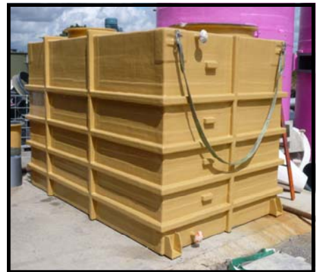
The chlorine scrubber tank during fabrication

The scrubber is designed to treat any accidental releases from the chlorine storage cylinders on site. In the extremely unlikely event of a serious chlorine leak, the scrubber is started and scrubs and neutralises the toxic gas, guaranteeing the safety of the workforce and surrounding population. The scrubber sump tank (pictured) stores enough caustic solution to deal with a worst-case 1 tonne release of chlorine.