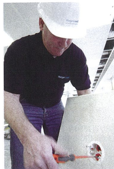
what's involved, one step at a time. www.morganlovell.co.uk

The office checklist is part of a series of guides from Morgan Lovell that take a complex issue – such as choosing a trusted office design and build contractor, or creating a sustainable office – and explaining