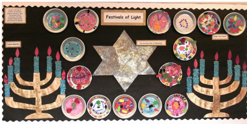
Reception A's 'Festivals of Light' display.

Here are some of the displays which can be found around the school.