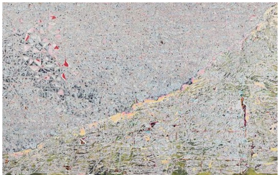
'Riding the Cut Vein' by Mark Bradford