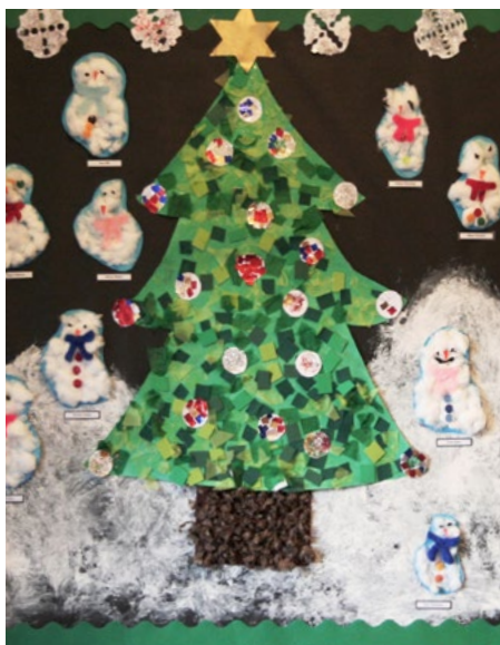
Reception B's Christmas Snowmen and Christmas Tree display.

The next school visit will be Saturday 2nd March, 9.30am - 12.00pm. In the meantime, please do not hesitate to contact the school uniform department at Harrods on 0207 225 5989.