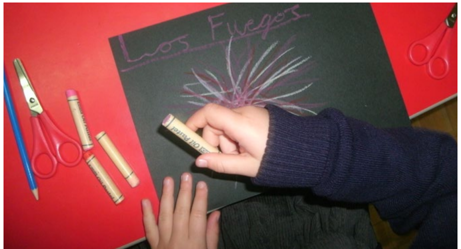
'Los Fuegos' (Fireworks) Activity at Spanish Club