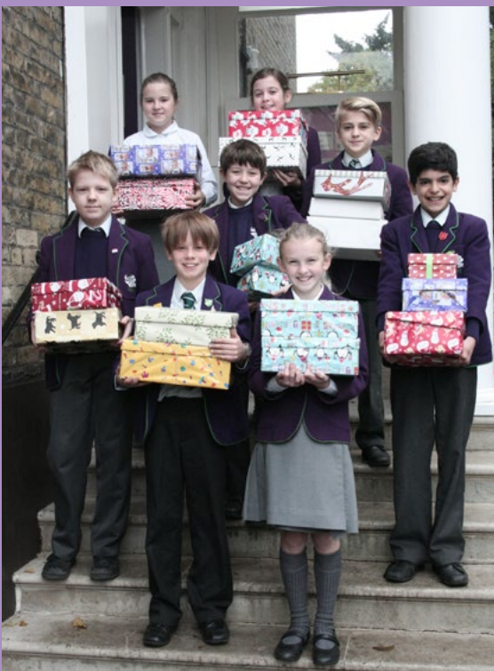
Prep 6 pupils with Samaritan's Purse gifts

Following on from the success of last year, we will be working in partnership with shelters in Vauxhall run by Missionaries of Charity by holding another Spring Clean Up event.