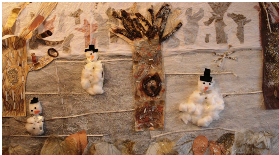
'Winter Wonderland' featuring work from Pre-Prep 1 - Prep 6.