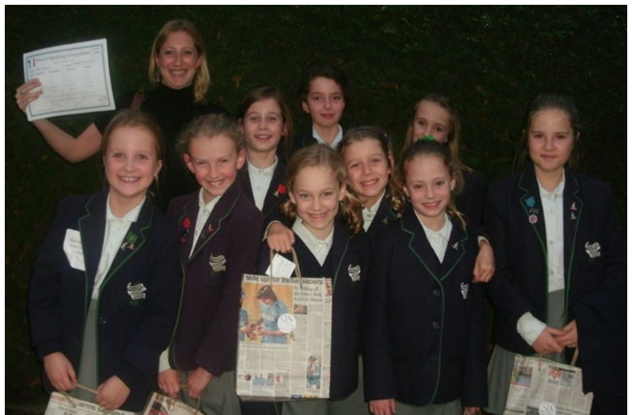
Prep 4, 5 & 6 Girls at the French Speaking Competition, Queen Anne's Caversham