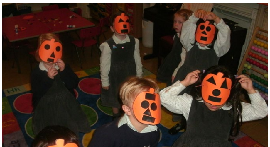
Pumpkin Mask Halloween Activity at French Club