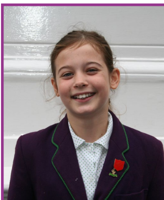
Girls' Sports Captain