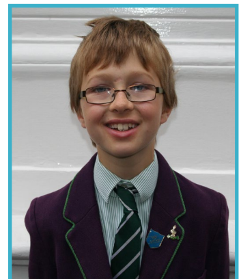
Aztecs' Vice Captain