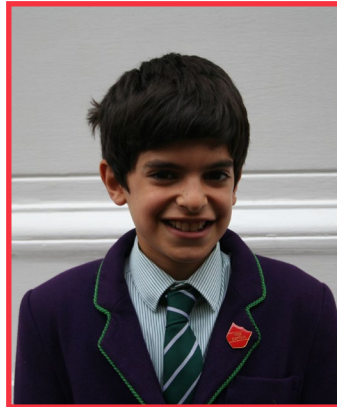
Romans' Vice Captain