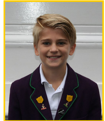
Egyptians' Vice Captain & Boys' Sports Captain