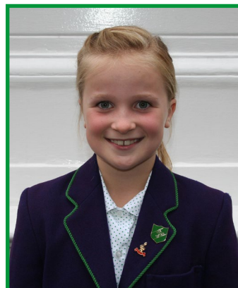
Greeks' Vice Captain