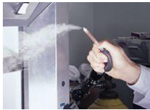
Smoke generation tube with Aspirator bulb