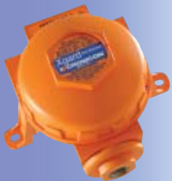
Industry-standard gas detectors