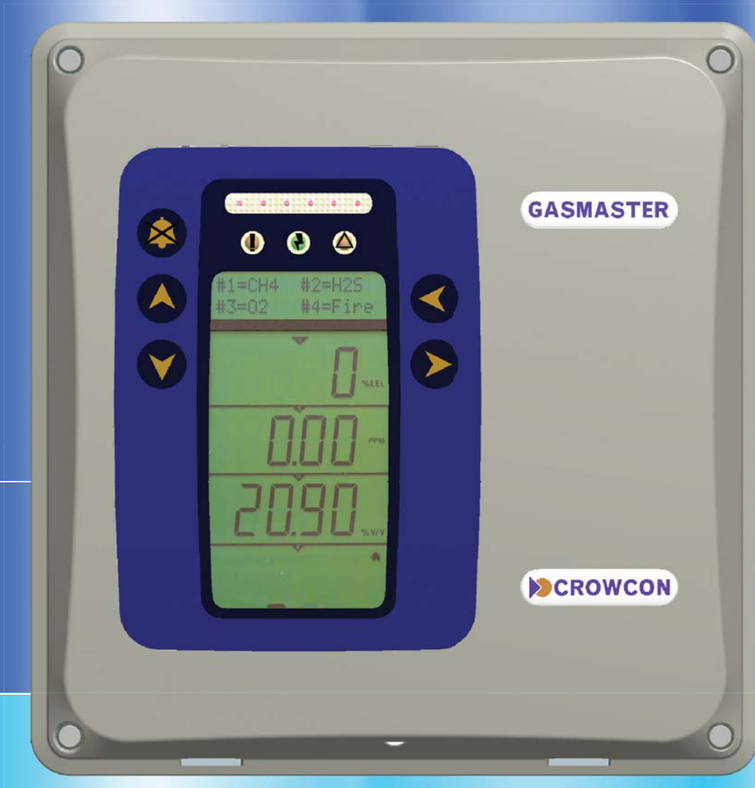
Control panel for gas and fire monitoring