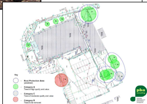
Tree constraints plans