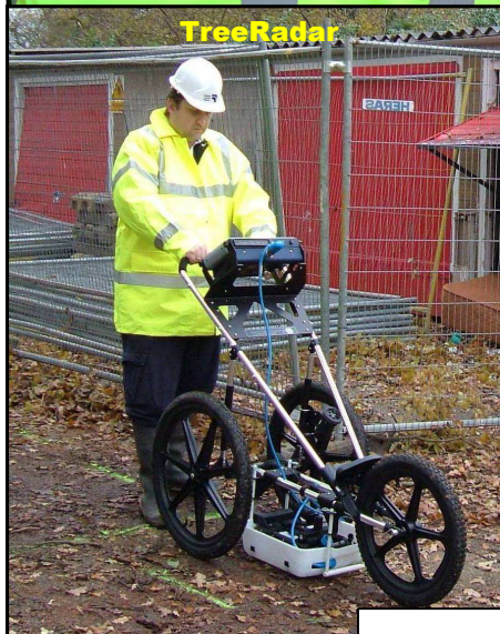
TreeRadar: Informed root assessments