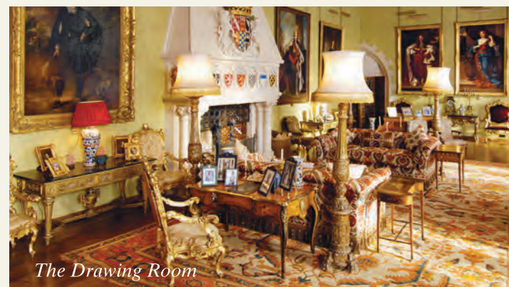
The Drawing Room